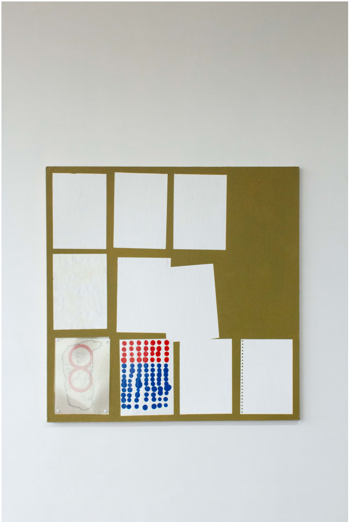
'fiches' acryl, and plastic sheets on mdf, 2022, 80x80cm