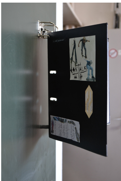
original front cover from 'don' talk' my first band, 2005