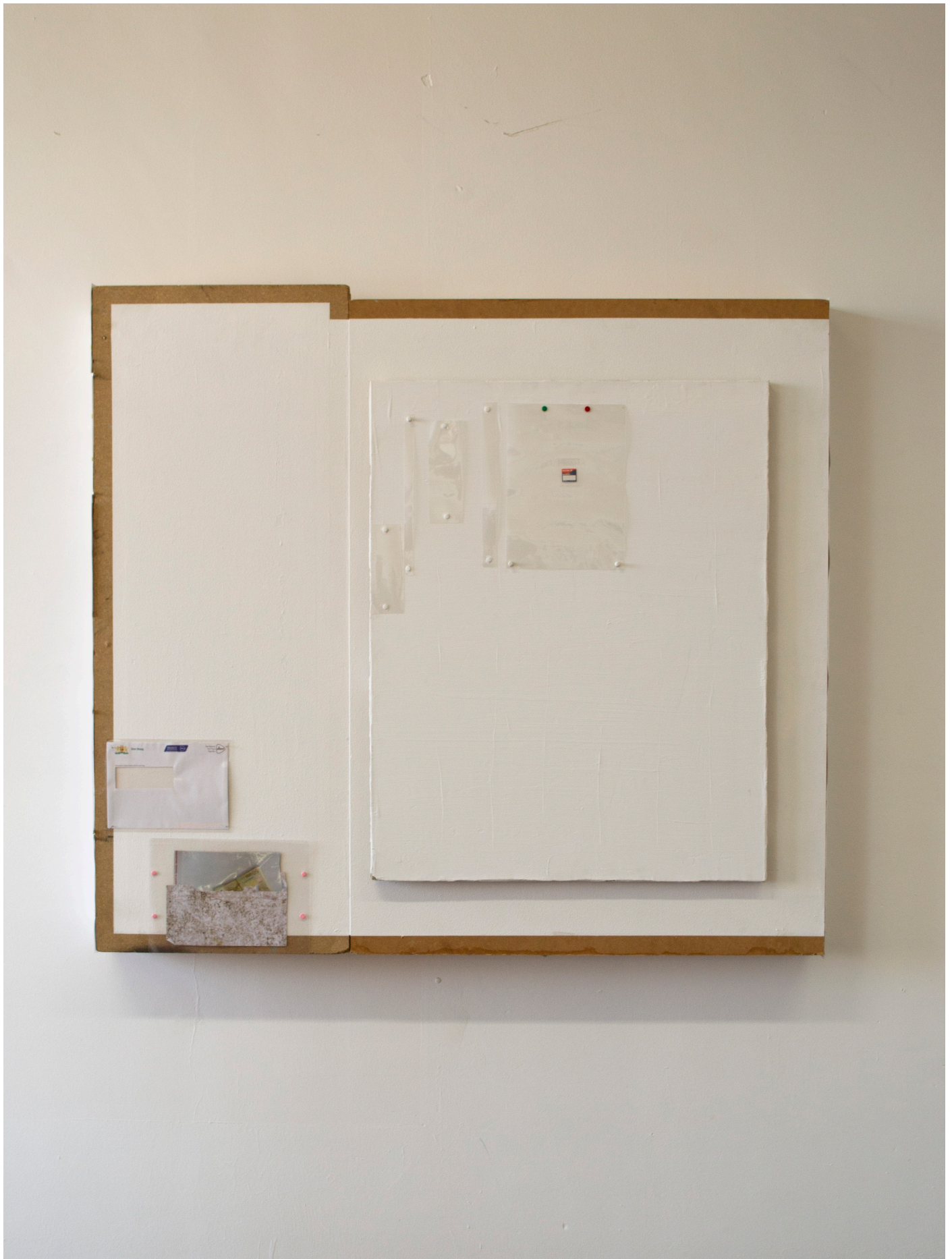
'handel en ambacht' collage, stretched canvas, laminated envelope with fake money, fake sd-card on mdf, 2022 150x150cm