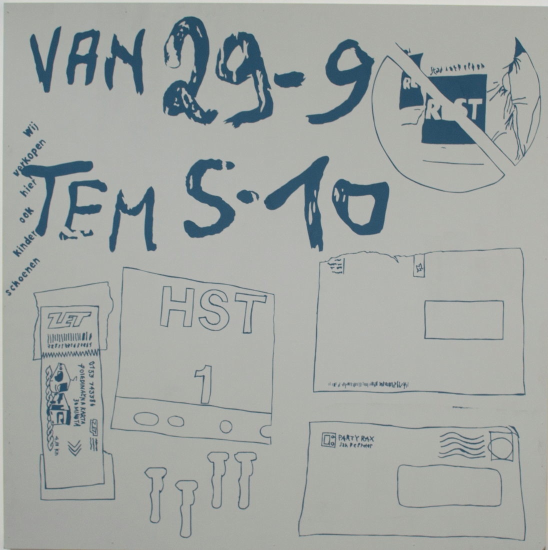
'van 29-9 tem 5-10' acrylic on mdf, 2023, 200x200cm