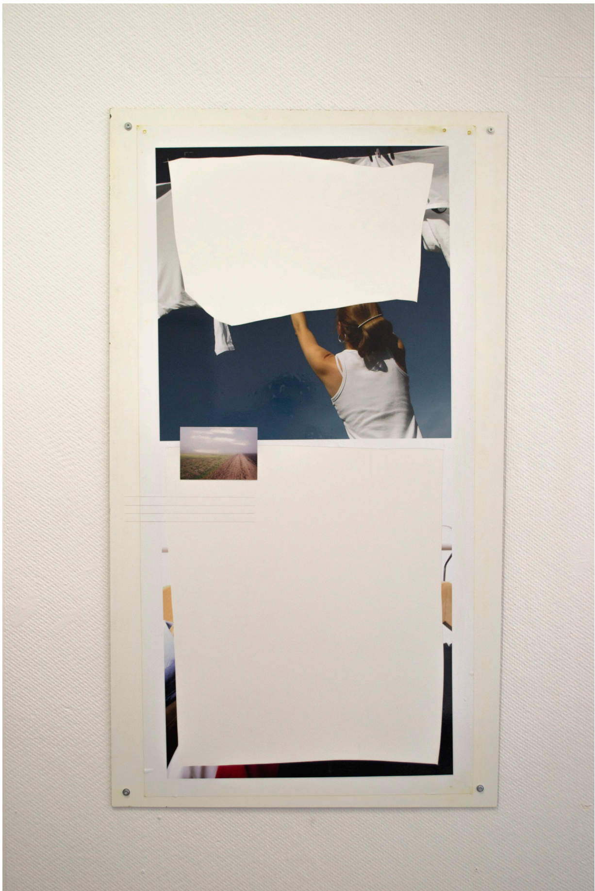
'mist' collage on wooden panel, 2022, 50x100cm