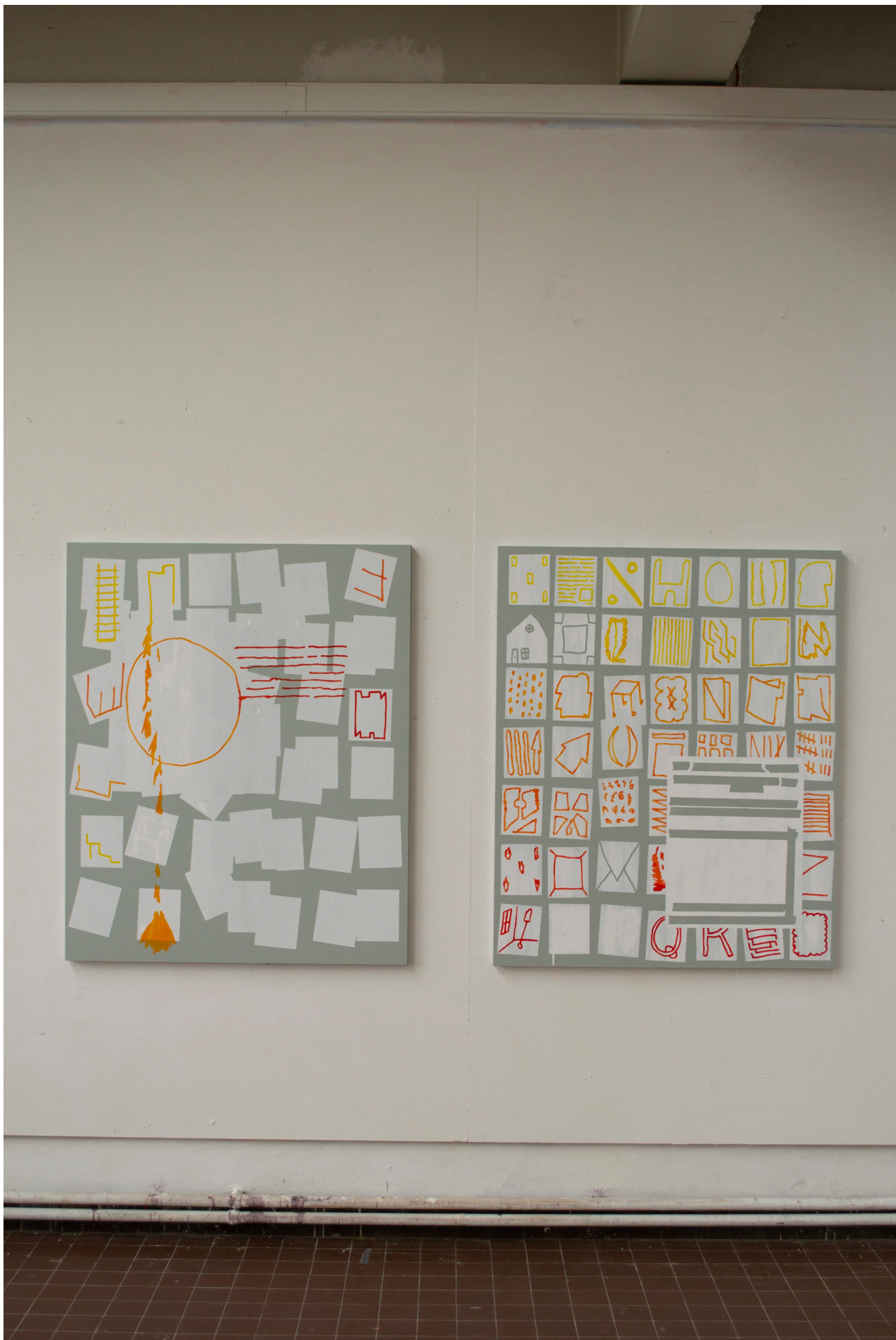
'energielabel A & B' acrylic on mdf, 2023 100x150cm (2x)