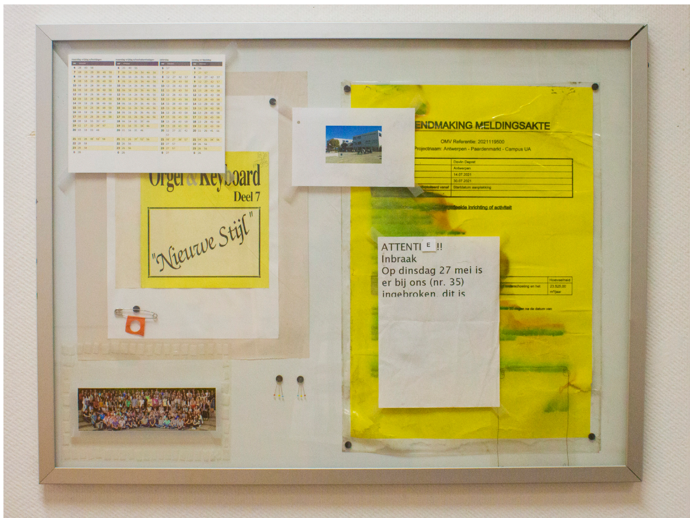
'rodestraat' collage from original 'de lijn' information mixed with personal archive, in information board, 2022, 60x80cm