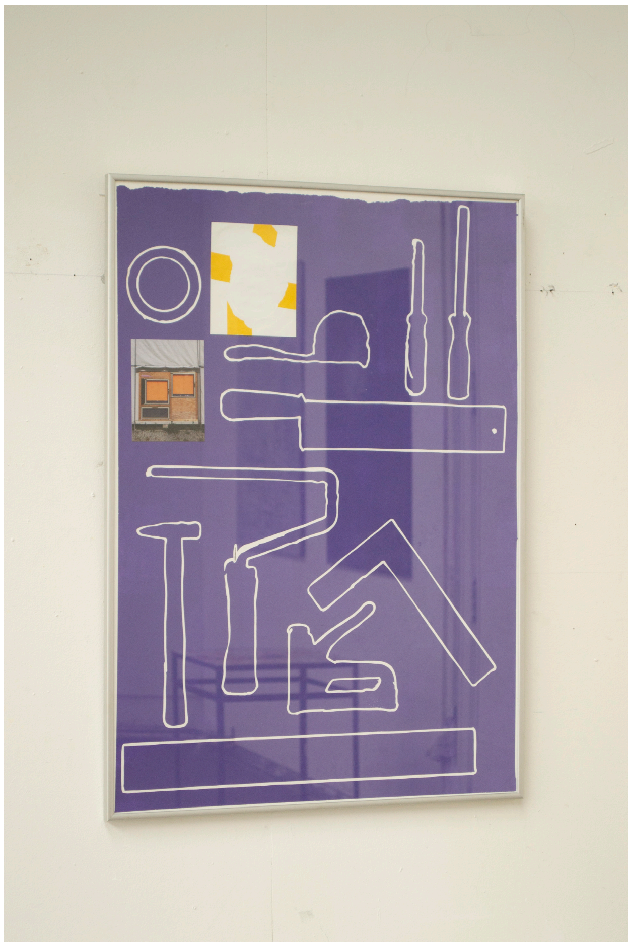
'gereedschapswand' acrylic and collage in glass frame, 2023, 29x47cm