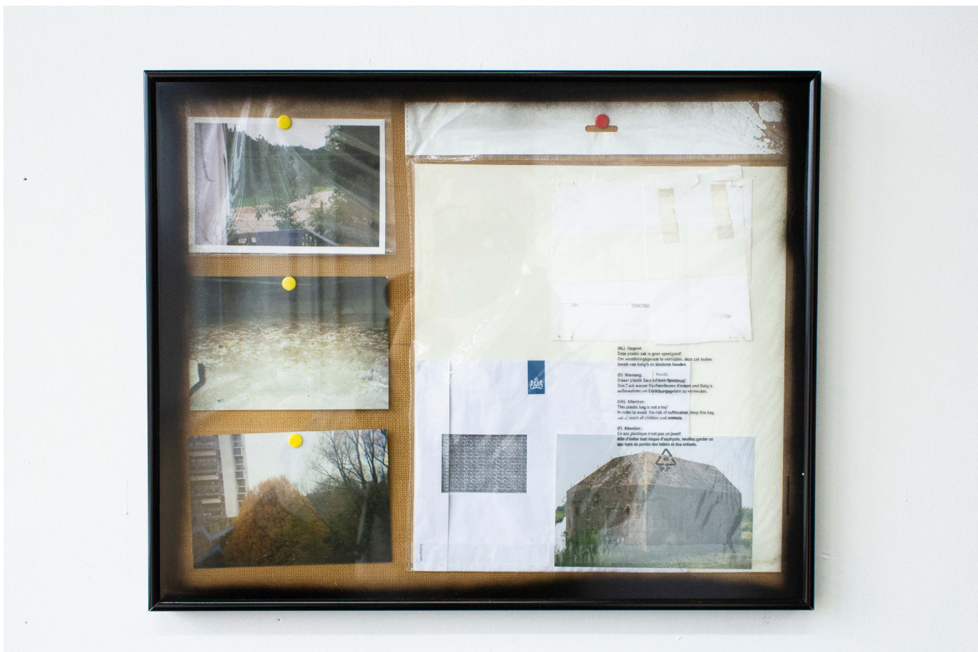
'defensie' (defence) collage from tax envelope and personal pictures and a plastic bag in frame, 2022, 30x43cm