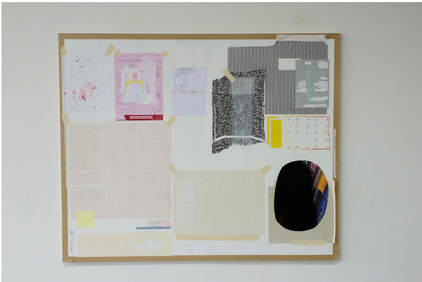
'school board' collage from personal and formal papers on mdf, 2022 122x100cm