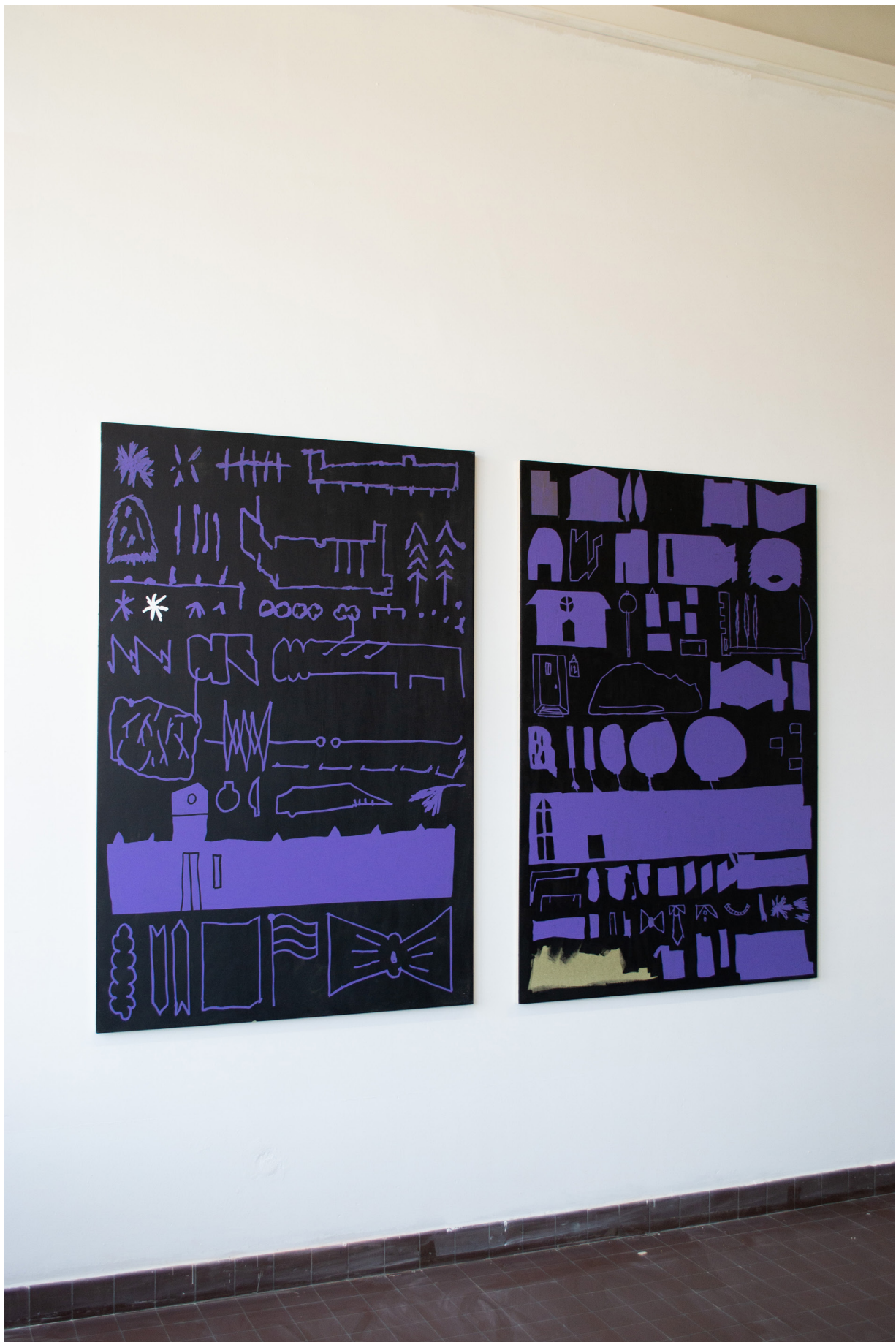
'residu 1&2' acrylic and whiteout on mdf, 2022, 100x150cm (2x)