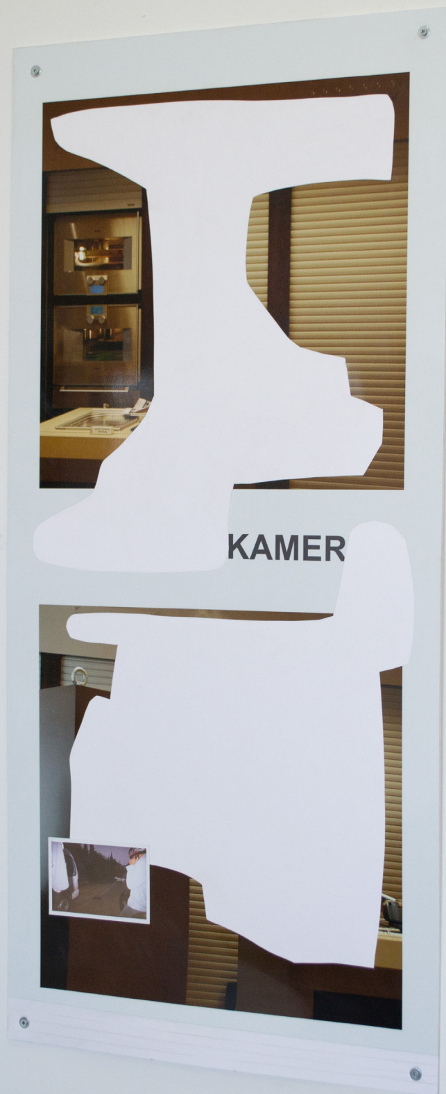
'kamer' cut out photoprint on softboard, 2022, 50x100cm