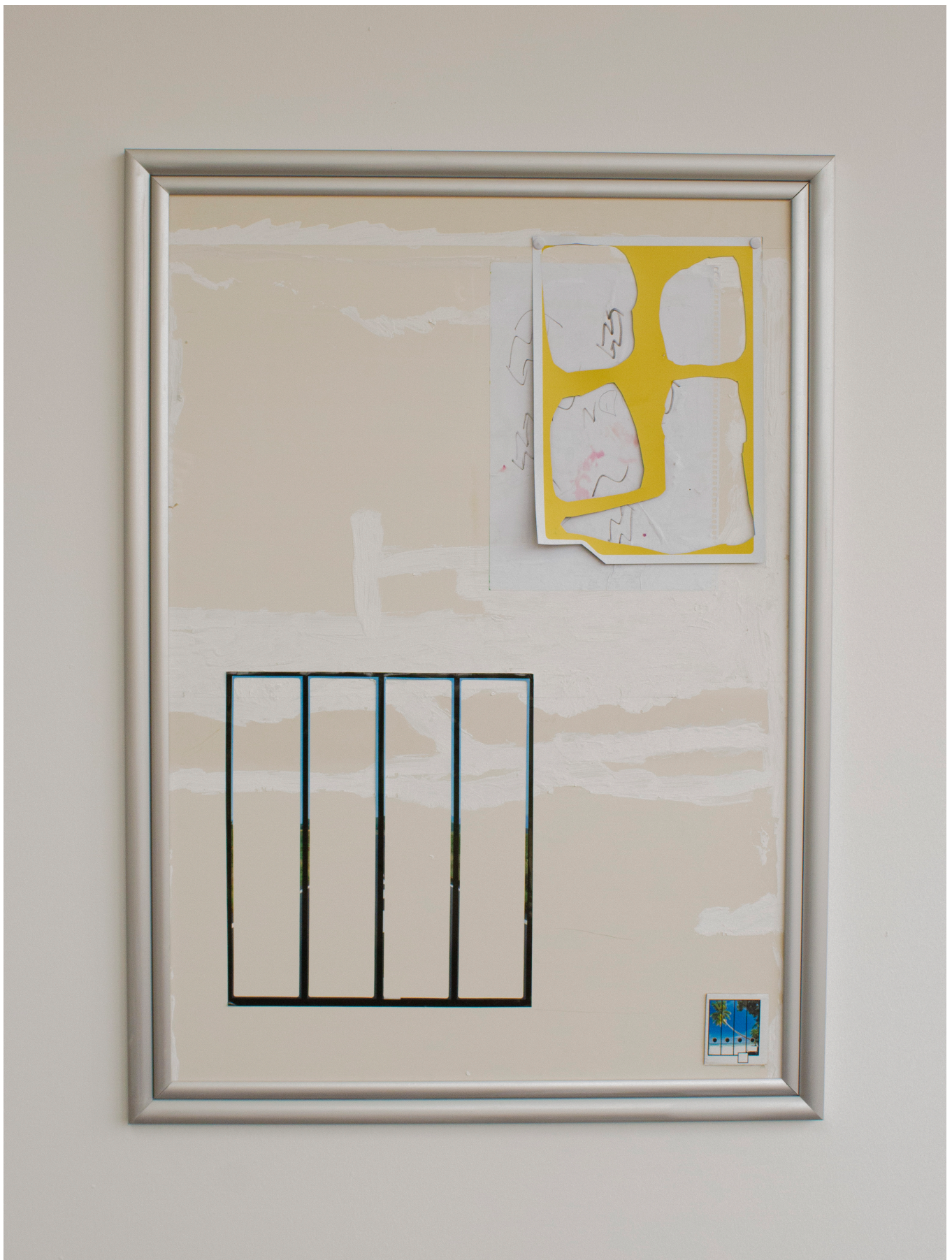
'untitled' collage in clickframe, 2022, 40x60cm