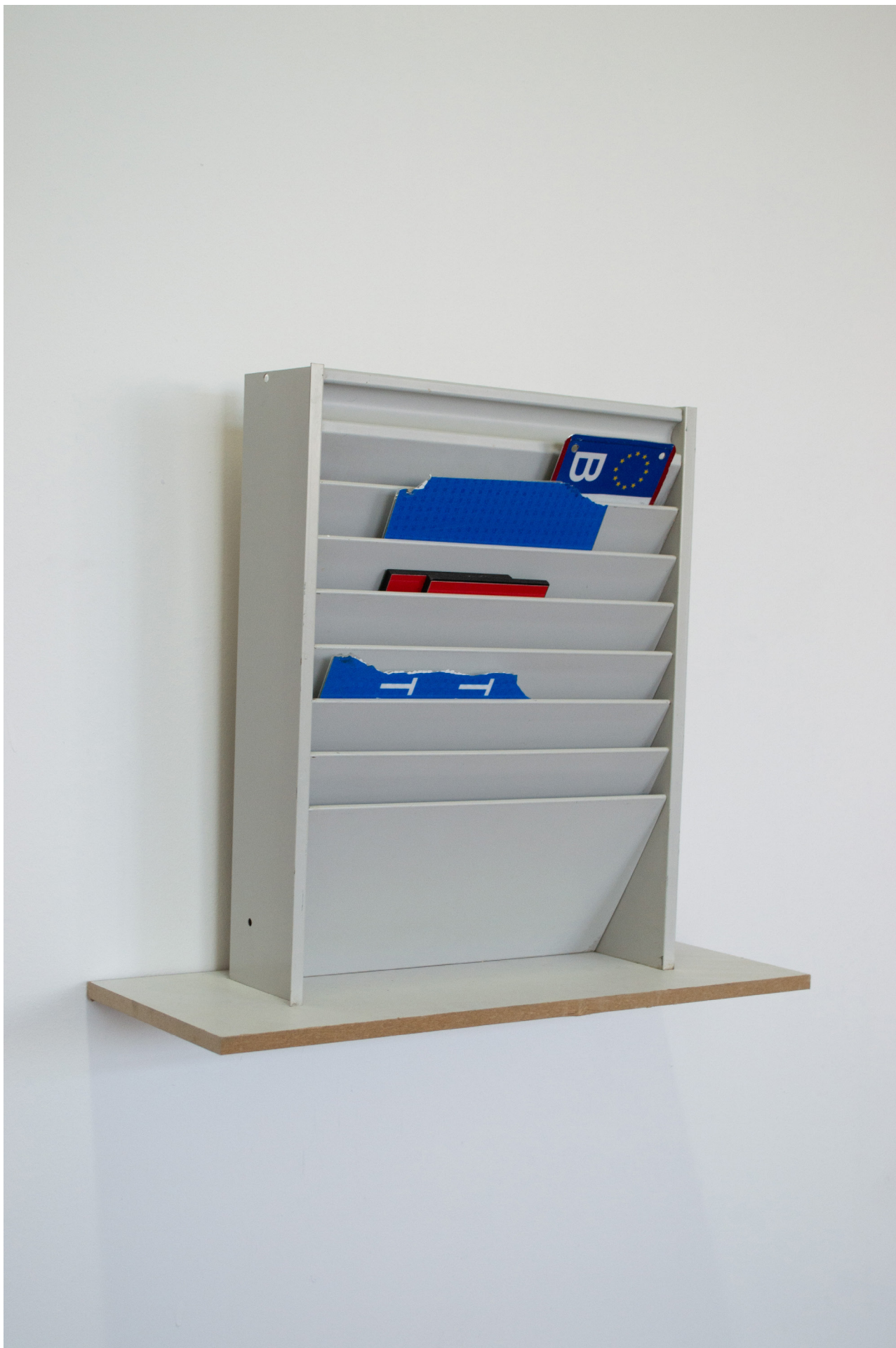
'gooi geen afval op de straat' (don't throw garbage on the street), found objects in letter tray 30x50cm