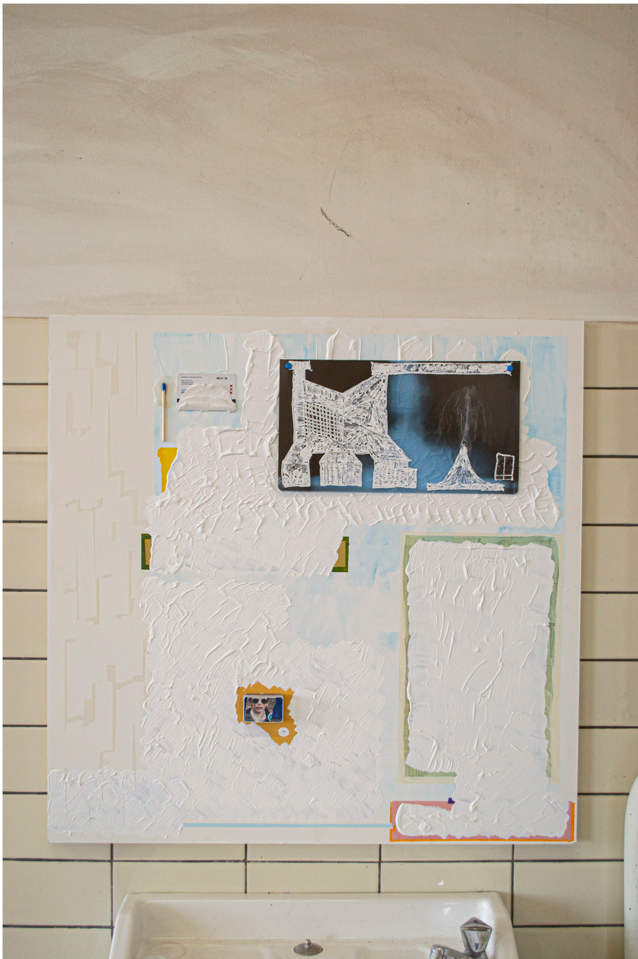
'carnaval 2002' collage from x-ray with whitout drawing, old bankcards and acrylic on mdf, 2022 75x75cm