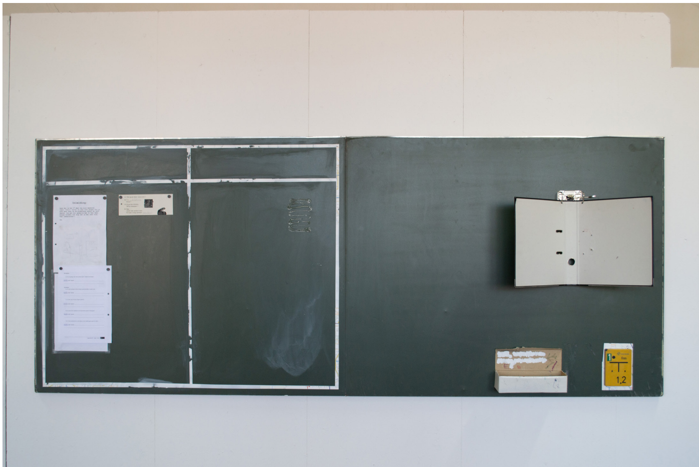
'schoolboard' collage from found homework, bantex, my first band photos, gas indicator board and acrylic on schoolboard, 2022, 100x300cm