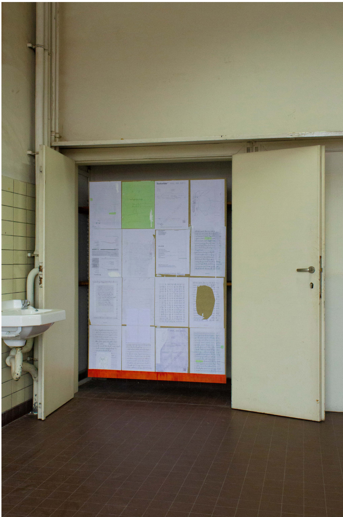
'juffrouw annie' my writing assingment from 2001, blown up and glued on MDF 2022, 200x150cm