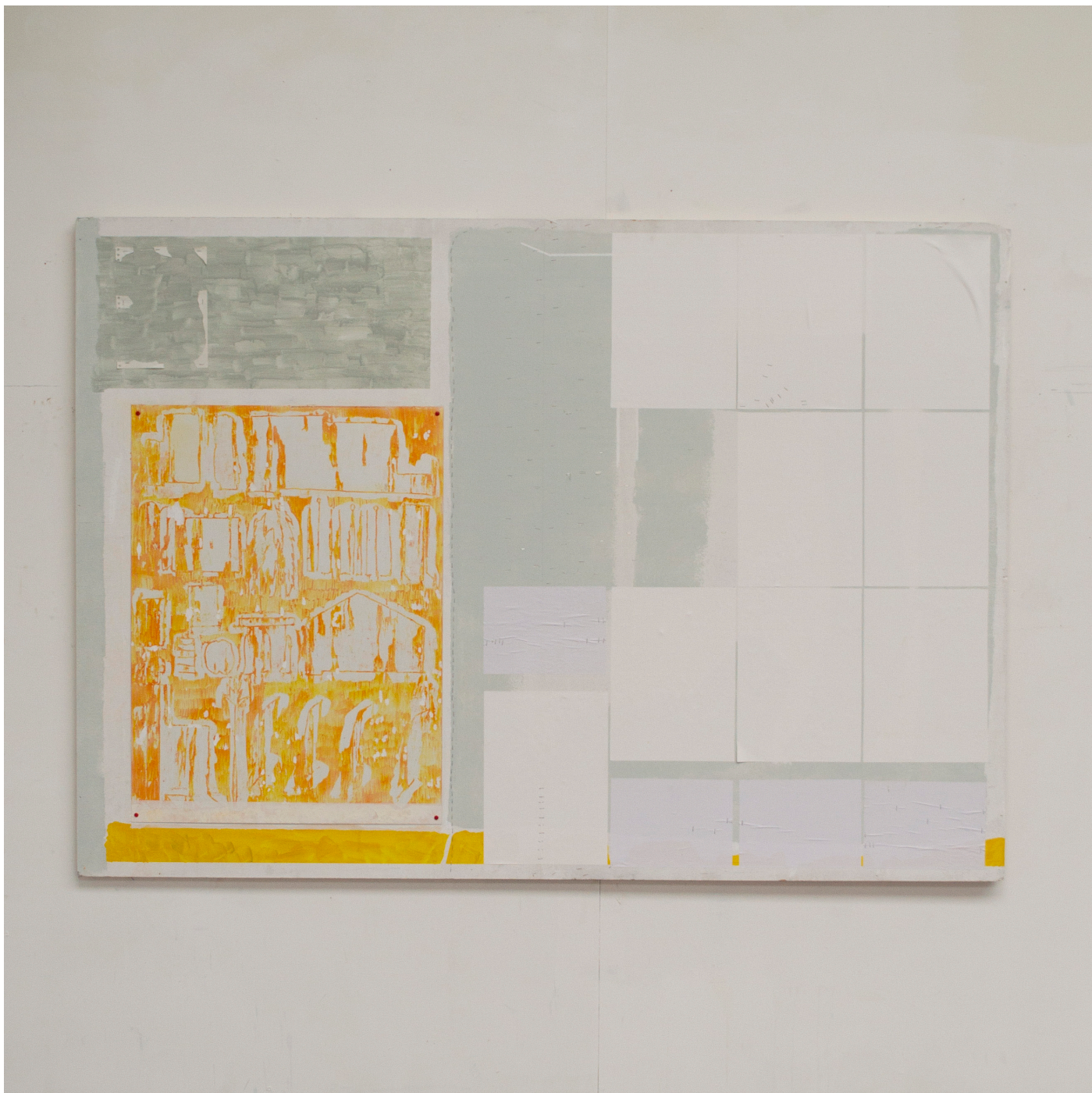
'algemeen gesprek' (general conversation), spraypaint on metal board, on wooden panel with collage, acrylics 2023, 150x250cm